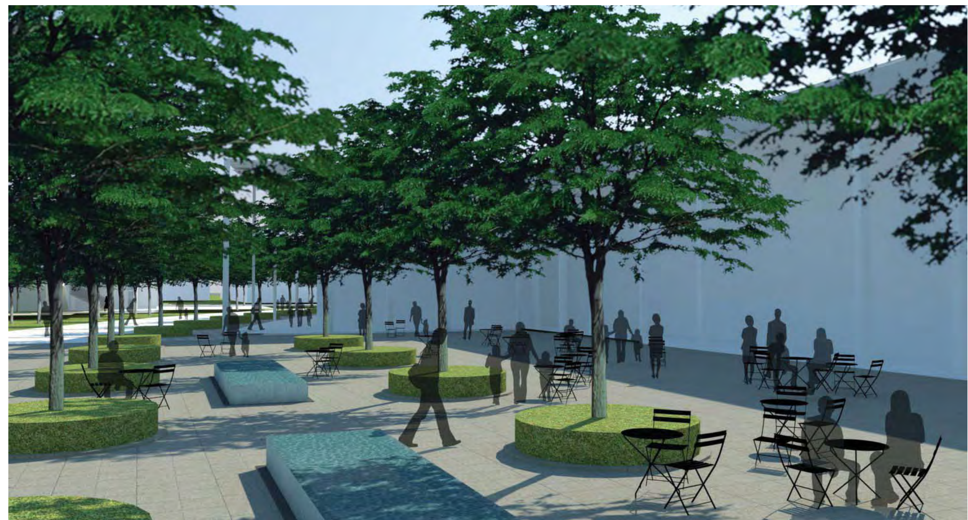
PERSPECTIVE @ DINING TERRACE