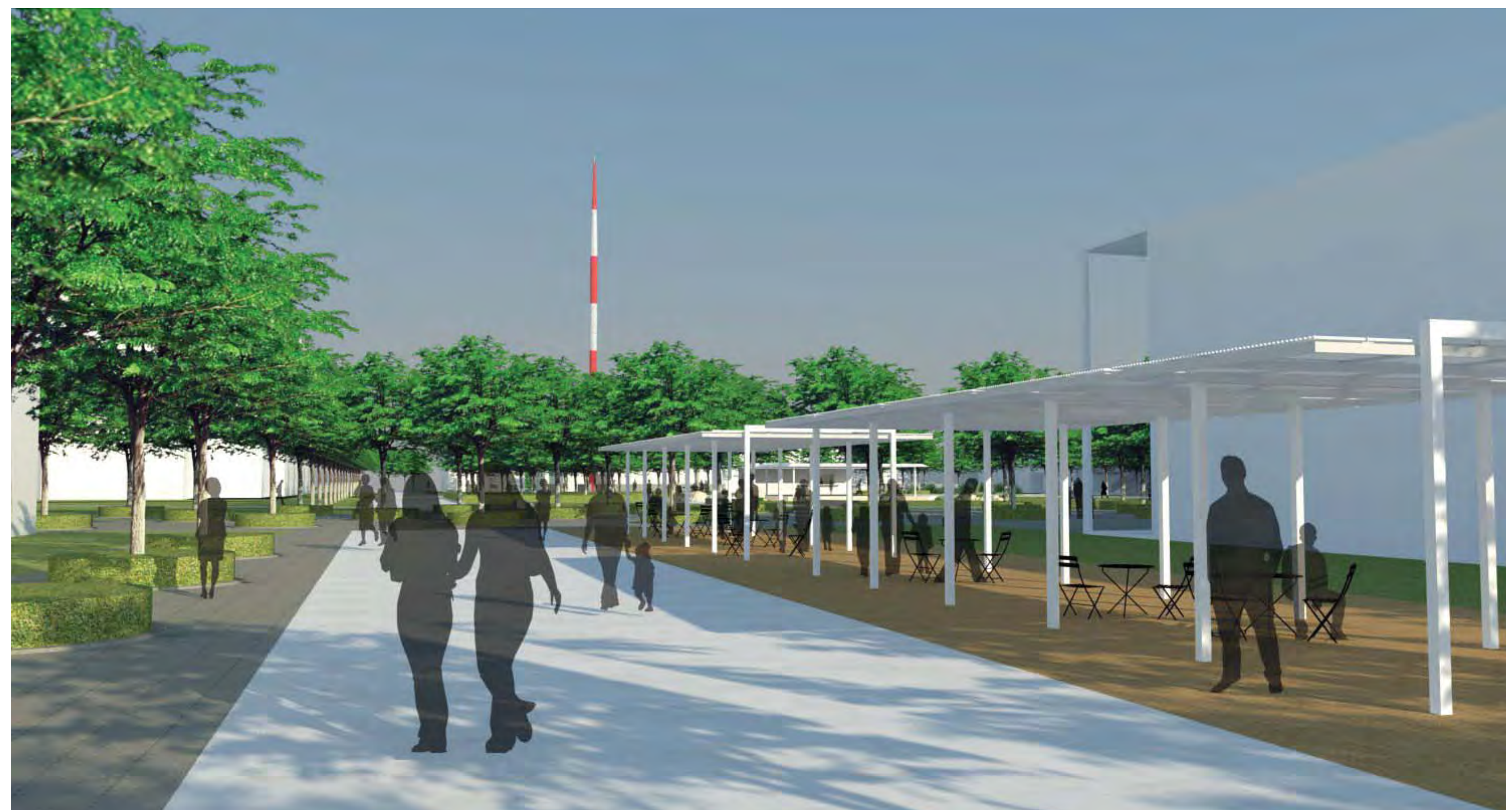
PERSPECTIVE @ SOUTH PROMENADE