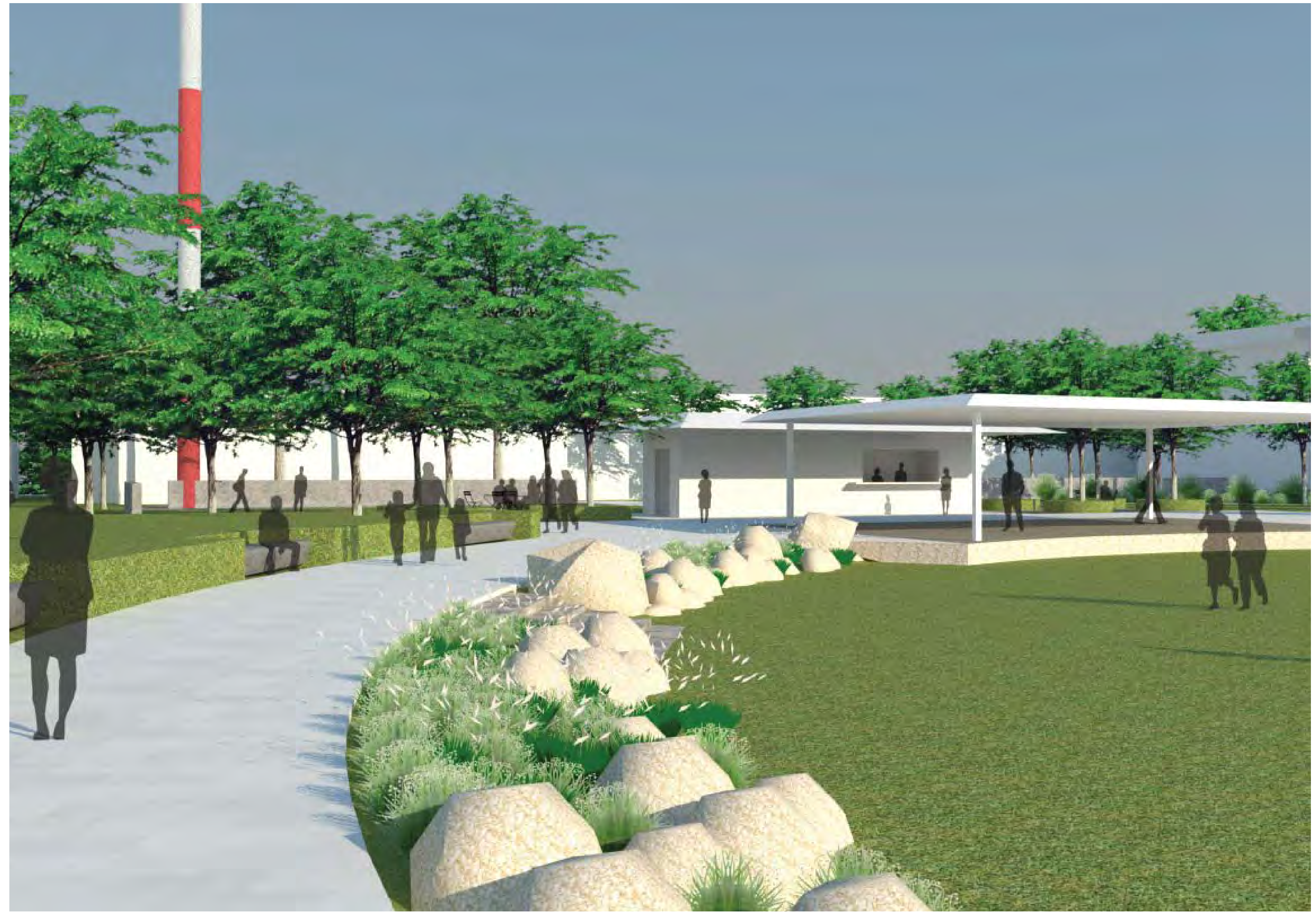
PERSPECTIVE @ CENTRAL GREEN